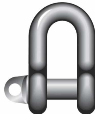
Large Dee Shackle

Due to our policy of continual product development, dimensions, weights and specifications may change without prior notice. Please check with your sales representative when ordering.